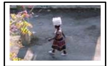
Woman carrying eggs to sell