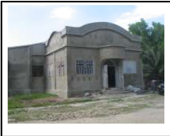
New Sanctuary at First Lutheran Church of Cap Haitien (main compound)