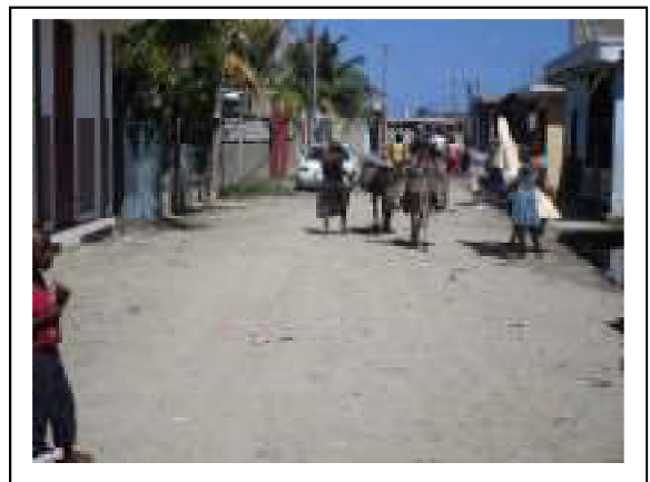
Sellers going home at the end of the day on the streets