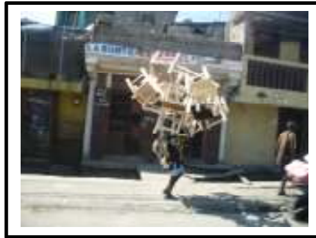
Seller of chairs