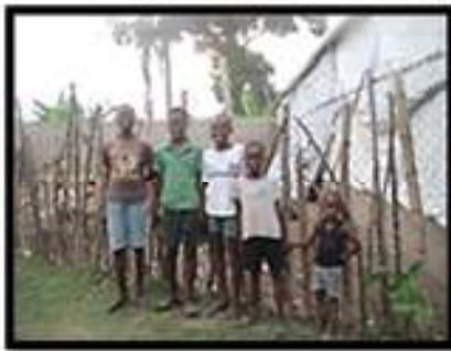
The boys who help their dad take care of the Lutheran Farm

The “Lutheran Farm”, as it is now called in the North District of Haiti, has a very successful broiler chicken project in place. When we visited in February, there were 1100 chickens which will be ready to butcher in a couple of weeks. When ready, they are sold alive to vendors who sell them on the street or deliver them to folks to butcher. The farm cannot keep up with the demand, and the chickens are coveted by the buyers. The profits are about $820 from each time broilers are sold, and that money is used to help pay pastors and teachers in the North District of the ELCH. There are five buildings on the grounds, and they could handle another 1200 chickens rotating them to allow them enough room as they grow. But the startup cost would be about $5000, including chicks, feed, transportation of feed, salaries for workers and other expenses. Also, the purchase of a feed grinder would cut expenses, but the cost of such a grinder is quite high. The corn and other grains could not be raised on the Lutheran Farm’s property, as there is no wall around most of the land, so grains would need to be purchased locally.