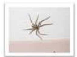
One of LaRaye's least favorite things