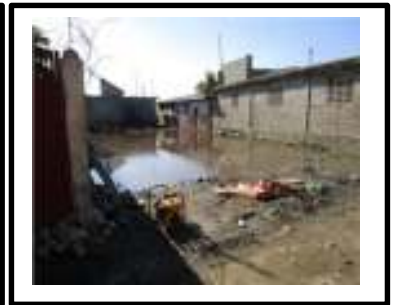
Gloria Dei construction meeting & the land

Since our visit, a contractor has been hired to clean up the land, pump the water, and are prepared to haul gravel in to build up the land. The process will take longer than expected, but we hope to have a building by the beginning of the school year next fall. We have received two donations of $20,000 each, one from the MN North LWML and the other from an individual, and have an additional $3400 saved for it. We estimate the total cost to be between $55,000 and $60,000.